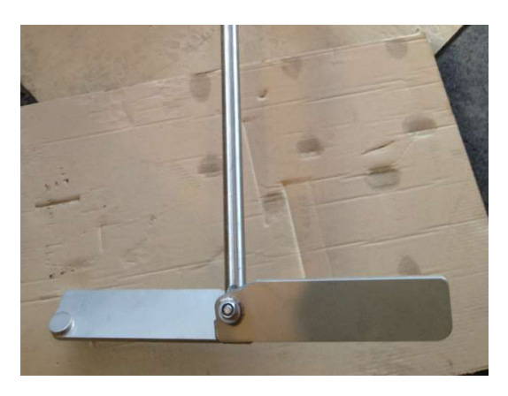
High Viscosity Impellers

Collapsible impellers of different diameters available for viscosities up to 2,000 cPs.