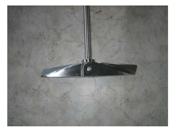
Low to Medium Viscosity

Collapsible impellers of different diameters available for viscosities up to 2,000 cPs.