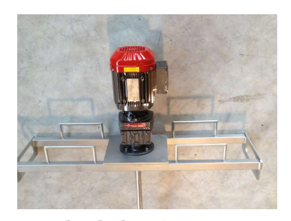
Standard Electric Motors

IBC mixers are used across a number of industries for a range of applications. We have supplied them for reconstituting product delivered in IBC's, for manufacturing cleaning products, for mixing agricultural solutions on farms, orchards and vineyards, for polymer make up to use in water treatment, for mixing additives and clarifiers in wineries, to name just a few!